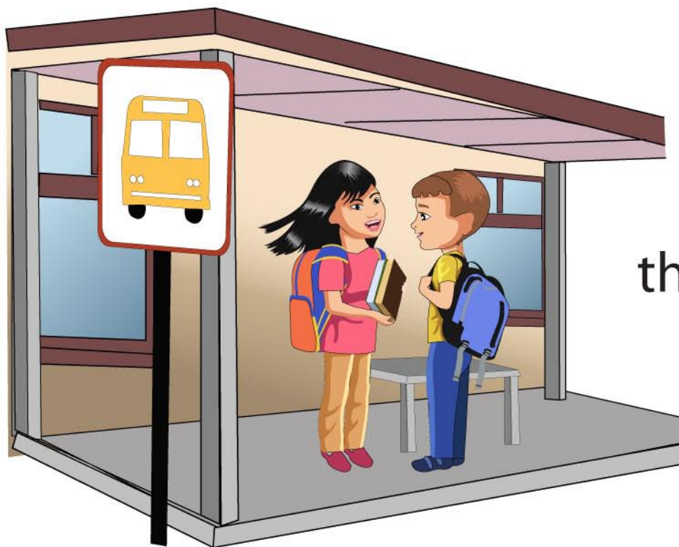
the bus stop