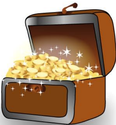
a treasure chest