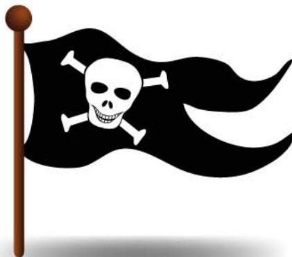
a pirate flag