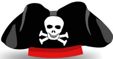
a pirate hat