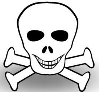
skull and crossbones