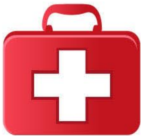
first aid kit