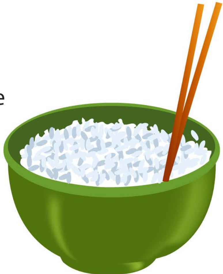
a bowl of rice