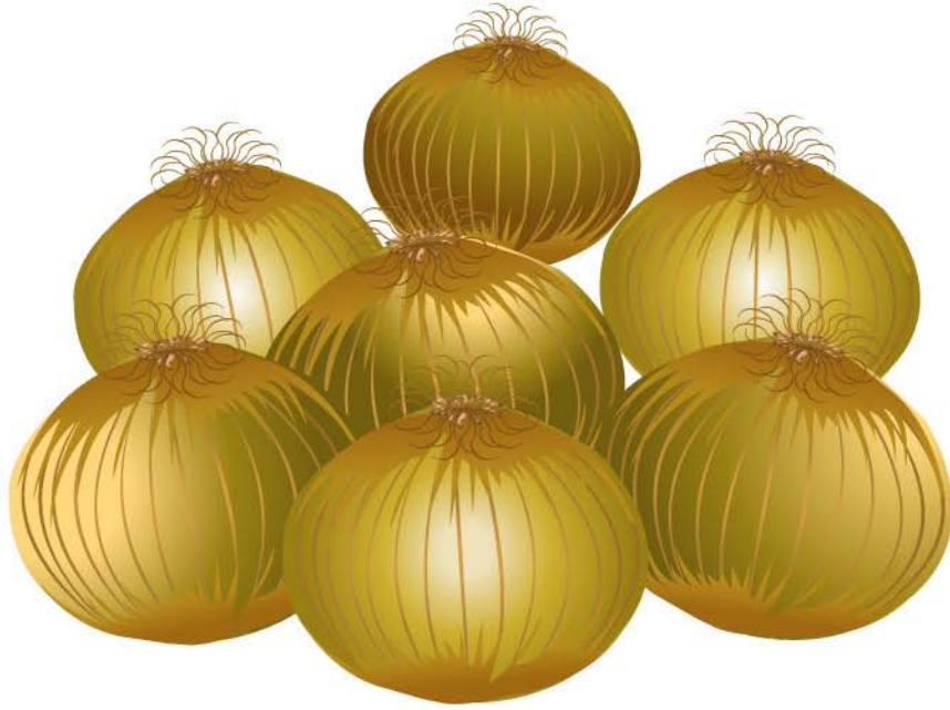
a kilogram of onions