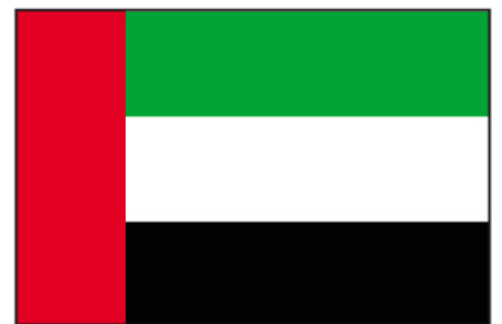
United Arab Emirates