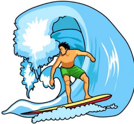
big wave surfing