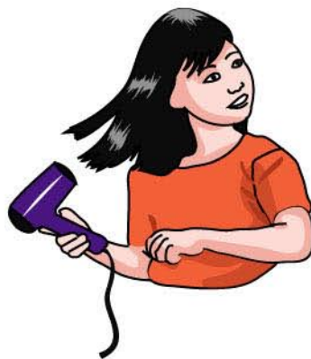
dry your hair