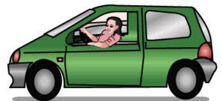
drive to work