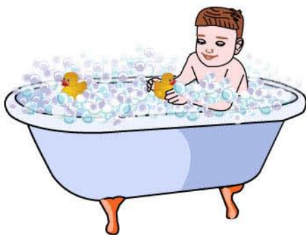
take a bath