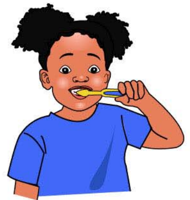
brush your teeth