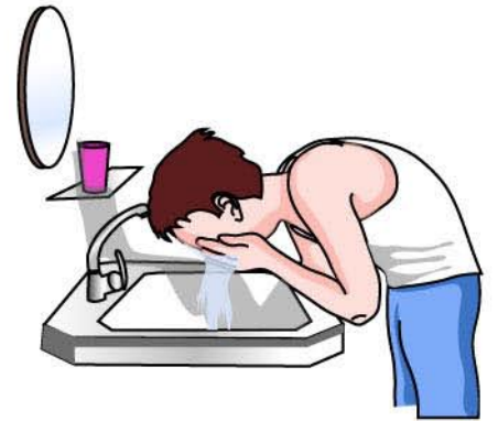
wash your face